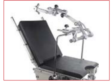
• Crossbar adaptor for skull clamp Ref: M9A 001 5 0