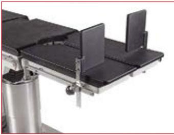
• Foot support Ref: M3J 000 0 0 (Ref of 1 ea)