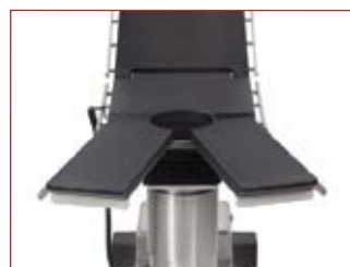
• Polyurethane mattress Ref: M2C 903 5 0 Ref: M2D 901 5 0 (550)