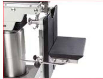
• Knee rest Ref: M9A 001 5 0 (200E) Ref: M30 000 0 0 (550)