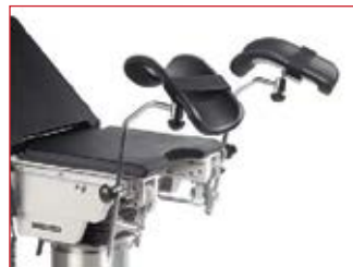
• Knee crutches Ref: M9N 000 0 0 (Ref of 1 ea) (Optional accessory for ENDO 2000E, ENDO 550S)