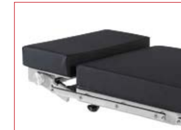
• Head section, high adjustable Ref: M9B 250 0 0 (2000E)