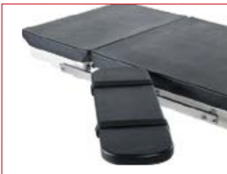
• Surgical table arm boards Ref: M3M 000 0 0 (Ref of 1 ea)