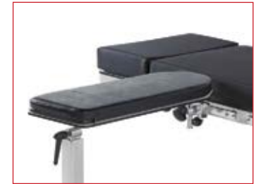
• Proctology attachment Ref: M3I 000 0 0