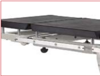
• Radiographic tabletop assembly kit Ref: M2C 400 5 0