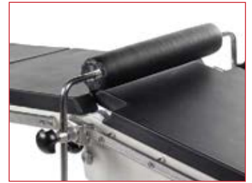
• Proctology attachment Ref: M3I 000 0 0