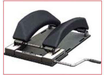
• Spinal surgery frame Ref: M9P 200 0 0