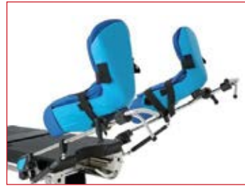
• Lithotomy leg positioning boat Ref: AU-OTJ01-001 (Ref of 1 pair)