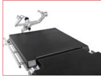
• Skull clamp Ref: M9A 000 0 0