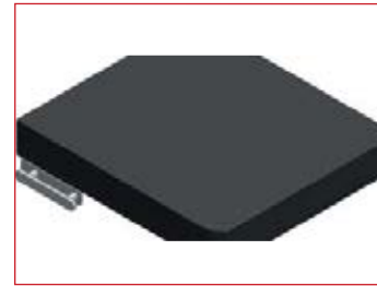
• Compact laminate leg section Ref: M9S 060 0 0 (2000E)