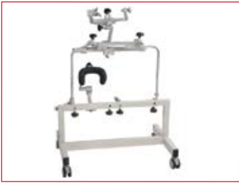
• Stand for skull clamp and horseshoe headrest Ref : M9K 000 0 0