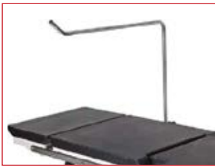
• Anaesthetist's frame Ref: M3S 000 0 0