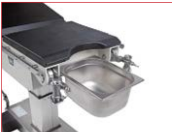
• Waste tray Ref: M9H 010 0 0 (2000E) Ref: M3Z 000 0 (550)