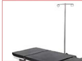
• I.V. stand Ref: M3T 000 0 0