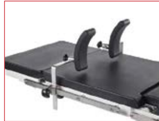
• Shoulder supports Ref: M3P 000 0 0 (Ref of 1 ea) (Optional accessories for ENDO 2000E)