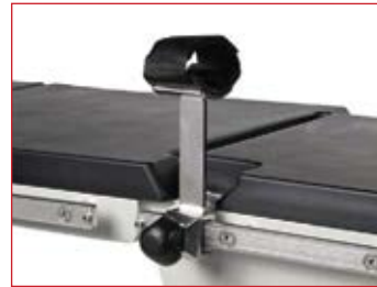
• Wrist grip Ref: M2D 333 5 0