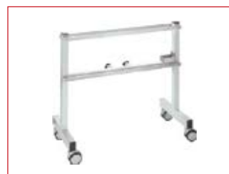
• Compact stand for surgical table accessories Ref: M3E 100 5 0 (Optional accessory for ENDO 2000E, ENDO 550S)