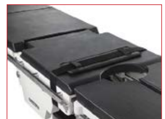
• Body strap (1 ea) Ref: M9E 000 0 0