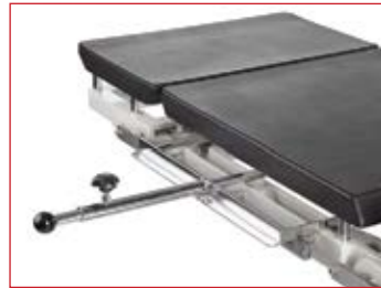
• X-ray cassette holder Ref: M9D 000 0 0