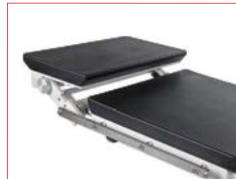
• Head section, high adjustable Ref: M9B 200 5 0 Ref: M9B 000 0 0 (550)