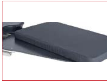
• Carbon fiber leg section Ref: M9S 050 0 0 (2000E)