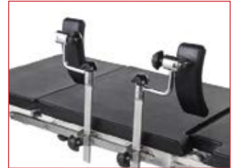
• Body supports Ref: M3R 000 0 0 (Ref of 1 ea) (Optional accessories for ENDO 2000E)