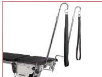
• Leg rest - Lithotomy position Ref: M2D 600 5 0 (Ref of 1 ea)