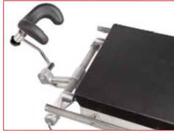
• Horseshoe headrest Ref: M3F 000 0 0