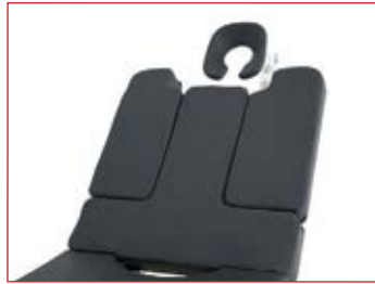
• Arthroscopic shoulder support Ref: M9S 150 0 0