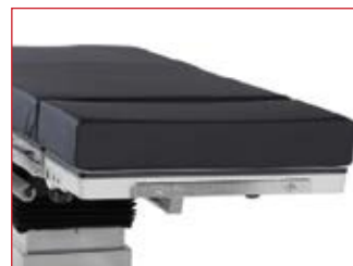
• Mattress Ref: M2C 800 5 0 (2000E)