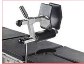
• Arthroscopic knee crutch Ref: M2D 309 5 0