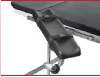
• Arm support Ref: M9M 000 0 0 (Ref of 1 ea)