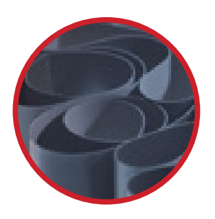
As standard: 0.50 mm Pb