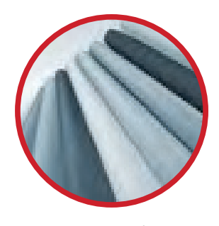
Optional: ComforTex® HPMF, ComforTex® HPMF Hybrid