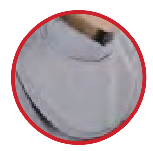
Spare hook-and-loop fastener (RA614AKV, adjustment via snap buttons)