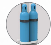
Two emergency oxygen cylinders