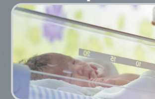
Pediatric and Neonatal Ventilation