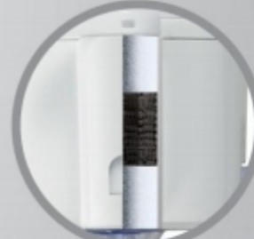
Responsible for the health of surgeons and assistants

Minimum leakage CO2 gas during operation