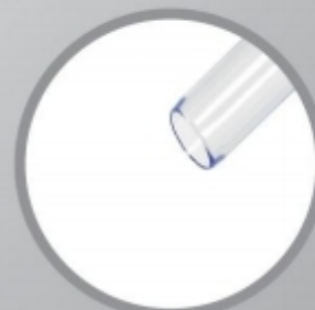
Transparent Cannula enables visual control of every surgical step.