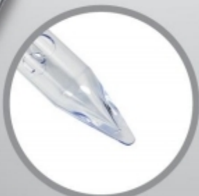
Bladless trocar tip

Equipped with filter for smoke On / Off possible