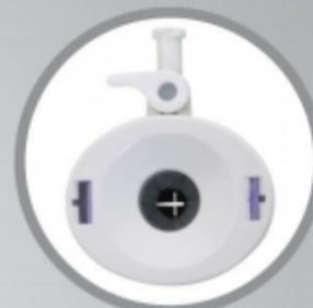
Dual Seal shields

Minimum leakage CO2 gas during operation