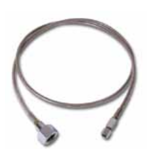
High pressure tubing CO<sub>2</sub>, gas connection, Device US/bottle DIN (Z5044-01)