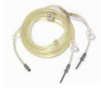
Tube set for Irrigation, reusable, 20 uses (T0506-01)