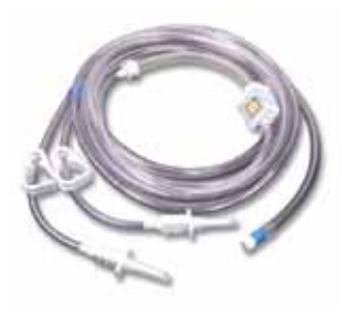
Tube set for Irrigation, disposable (T0505-01)

Power supply cord and further accessories available upon request.