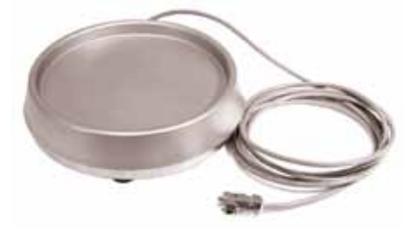
Differential volume scale (Z0223-01)