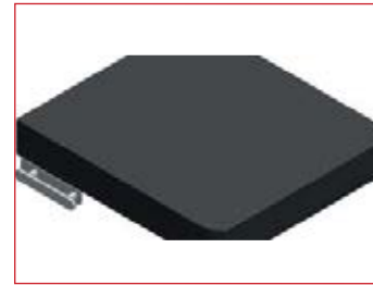
• Compact laminate leg section Ref: M9S 060 0 0 (2000E)