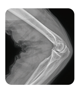
Lateral elbow joint