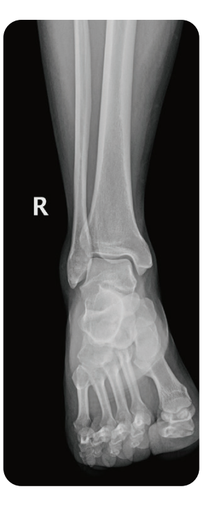
Frontal ankle joint