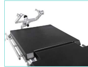
Skull clamp Ref: M9A 000 0 0