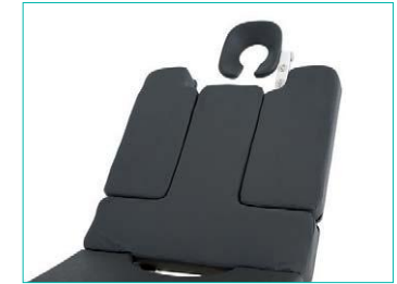
Arthroscopic shoulder support Ref: M9S 150 0 0