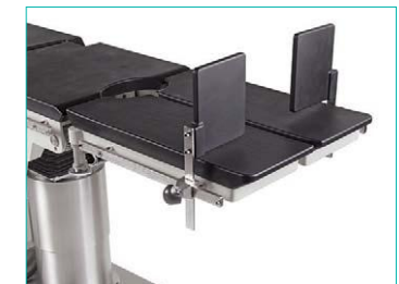
Foot support Ref: M3J 000 0 0 (Ref of 1 ea)