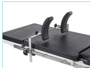
Shoulder supports Ref: M3P 000 0 0 (Ref of 1 ea) (Optional accessories for ENDO 2000E)