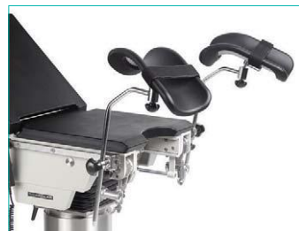
Knee crutches Ref: M9N 000 0 0 (Ref of 1 ea) (Optional accessory for ENDO 2000E, ENDO 550S)