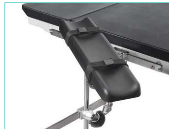
Arm support Ref: M9M 000 0 0 (Ref of 1 ea)