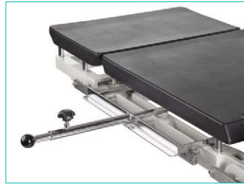
X-ray cassette holder Ref: M9D 000 0 0