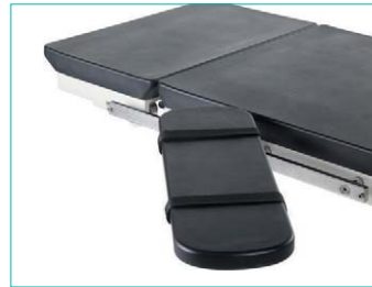
Surgical table arm boards Ref: M3M 000 0 0 (Ref of 1 ea)