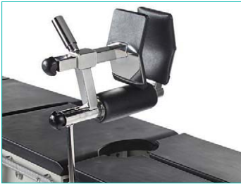
Arthroscopic knee crutch Ref: M2D 309 5 0