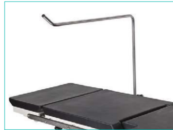
Anaesthetist's frame Ref: M3S 000 0 0