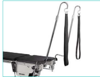
Leg rest - Lithotomy position Ref: M2D 600 5 0 (Ref of 1 ea)