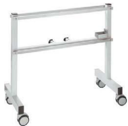
Compact stand for surgical table accessories Ref: M3E 100 5 0 (Optional accessory for ENDO 2000E, ENDO 550S)