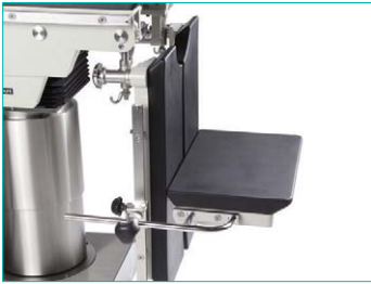
Knee rest Ref: M9L 000 0 0 (2000E) Ref: M30 000 0 0 (550)