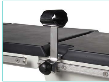
Wrist grip Ref: M2D 333 5 0