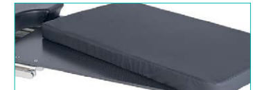
Carbon fiber leg section Ref: M9S 050 0 0 (2000E)