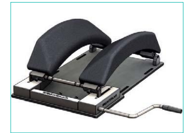
Spinal surgery frame Ref: M9P 200 0 0