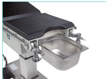
Waste tray Ref: M9H 010 0 0 (2000E) Ref: M3Z 000 0 (550)