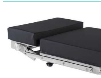
Head section, high adjustable Ref: M9B 250 0 0 (2000E)