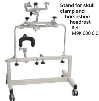
Stand for skull clamp and horseshoe headrest Ref: M9K 000 0 0