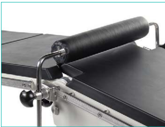
Proctology attachment Ref: M3I 000 0 0