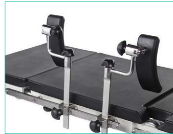
Body supports Ref: M3R 000 0 0 (Ref of 1 ea) (Optional accessories for ENDO 2000E)