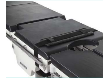
Body strap Ref: M9E 000 0 0