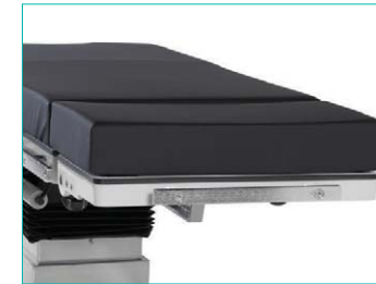
Mattress Ref: M2C 800 5 0 (2000E)