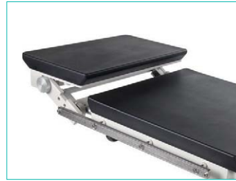
Head section, high adjustable Ref: M9B 200 5 0 Ref: M9B 000 0 0 (550)