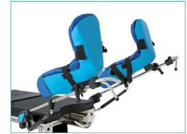
Lithotomy leg positioning boat Ref: AU-OTJ01-001 (Ref of 1 pair)