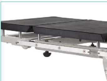
Radiographic tabletop assembly kit Ref: M2C 400 5 0 Radiographic tabletop kit Ref: M3V 000 0 (550)