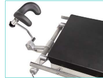
Horseshoe headrest Ref: M3F 000 0 0