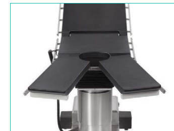
Polyurethane mattress Ref: M2C 903 5 0 Ref: M2D 901 5 0 (550)