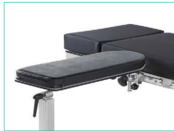
Arm/hand surgical section Ref: M9M 100 0 0