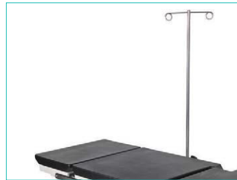
I.V. stand Ref: M3T 000 0 0