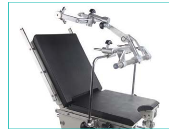
Crossbar adaptor for skull clamp Ref: M9A 001 5 0