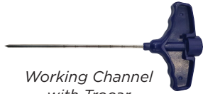
Working Channel with Trocar